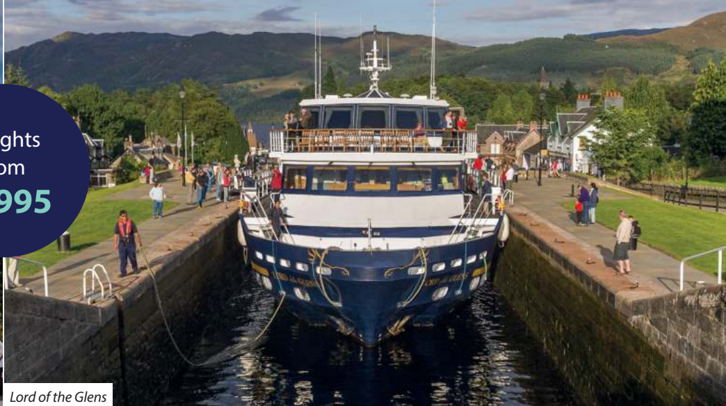
Lord of the Glens