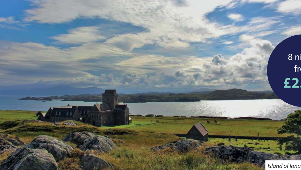
Island of Iona