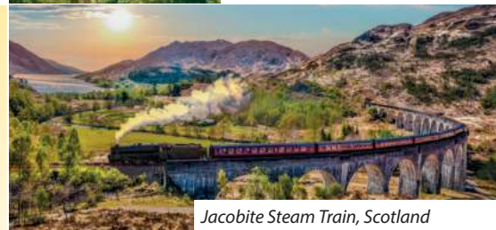
Jacobite Steam Train, Scotland