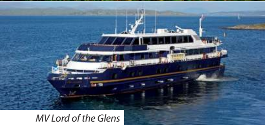
MV Lord of the Glens