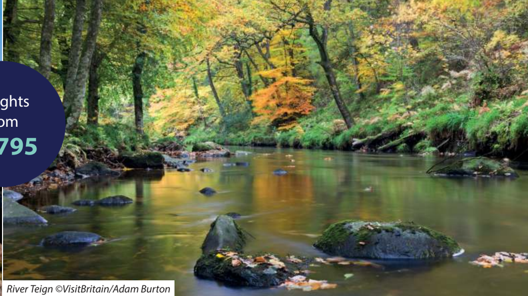
River Teign