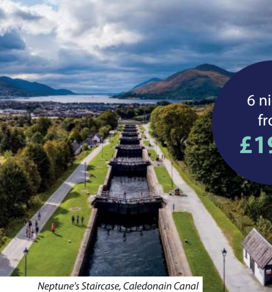
Neptune's Staircase, Caledonian Canal