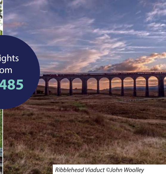
Ribblehead Viaduct