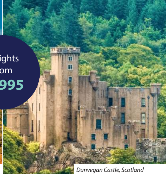
Dunvegan Castle, Scotland