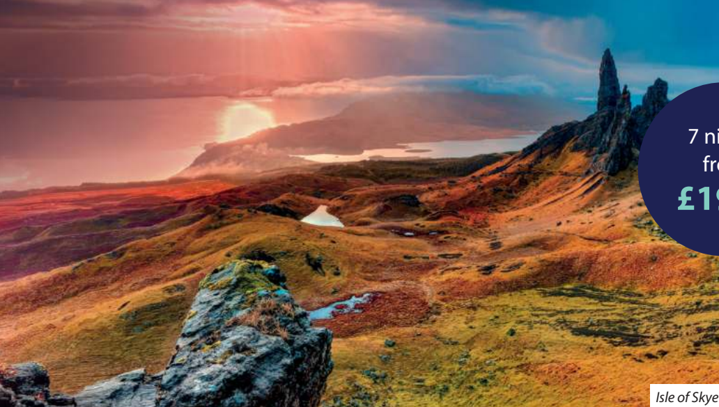
Isle of Skye