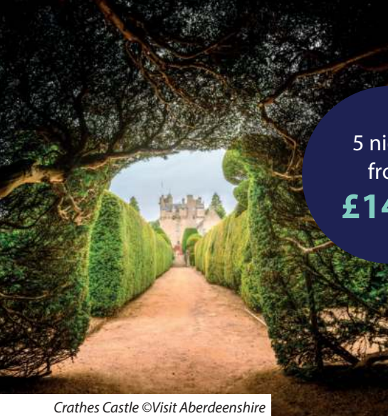
Crathes Castle