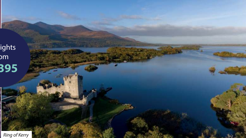
Ring of Kerry