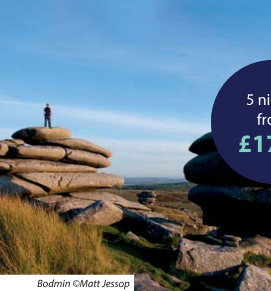
Bodmin