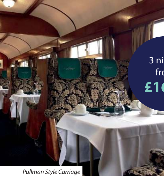
Pullman Style Carriage