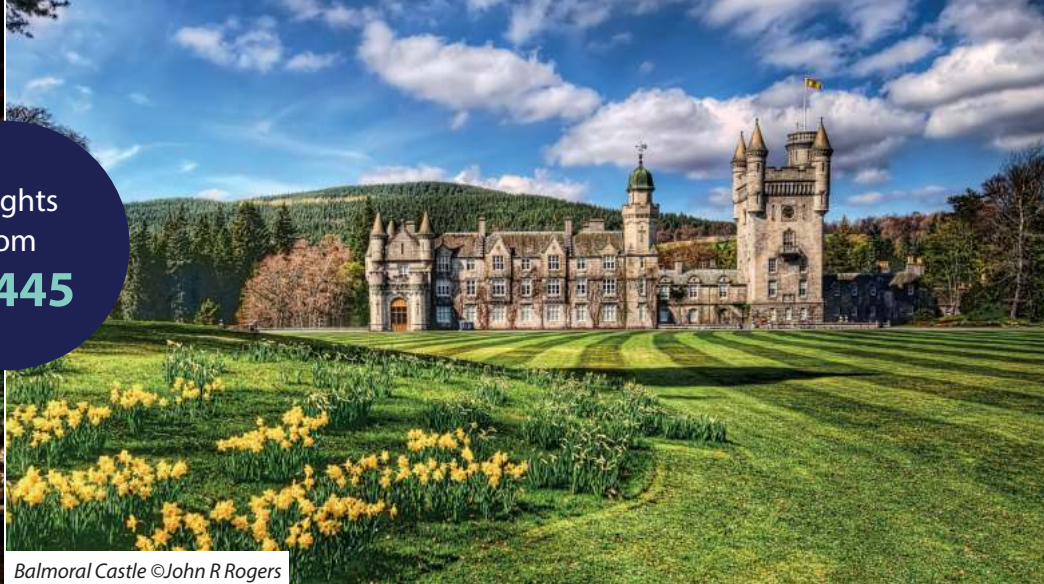
Balmoral Castle