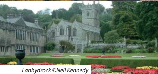
Lanhydrock