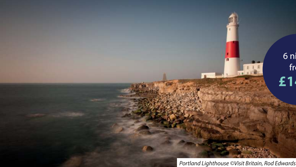
Portland Lighthouse