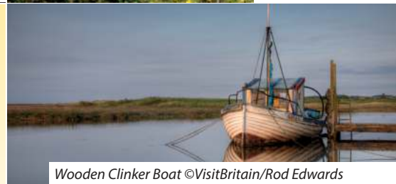
Wooden Clinker Boat